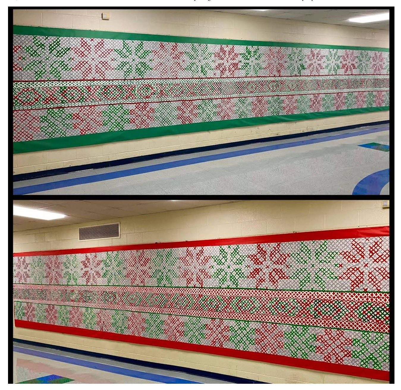
First grade worked on a "Cozy Sweater" mural! They learned about the knitted patterns of the Fair Isle Sweaters and used simple X marks to create their own version of stitches. Another amazing mural, Mrs. Cook!